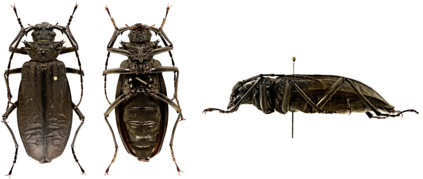
Fig. 3. Psalidosphryon spiniscapus (Schwarzer, 1924), ♀, Indonesia, Sulawesi, VII.2011 (NDCF n°7619).