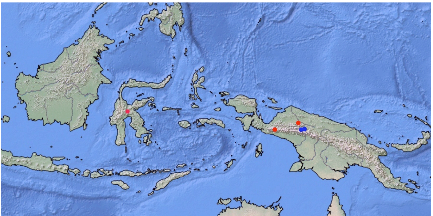
Fig. 5. Distribution map in Indonesia: Psalidosphryon andreevi n. sp. (●) & Psalidosphryon spiniscapus (●)

Also, it is necessary to modify the description of the genus Psalidosphryon Komiya, by removing the peculiarity of the presence of a spine at the apex of the first antennomere. Another character which was not noted by Komiya (2001) should be added to the genus Psalidosphryon to distinguish it from Osphryon . The females of Psalidosphryon have atrophied membranous hind wings, meaning they are apterous.