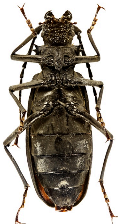
Fig. 2. Psalidosphryon andreevi n. sp., ♀, holotype, Indonesia, West Papua, Pass Valley.