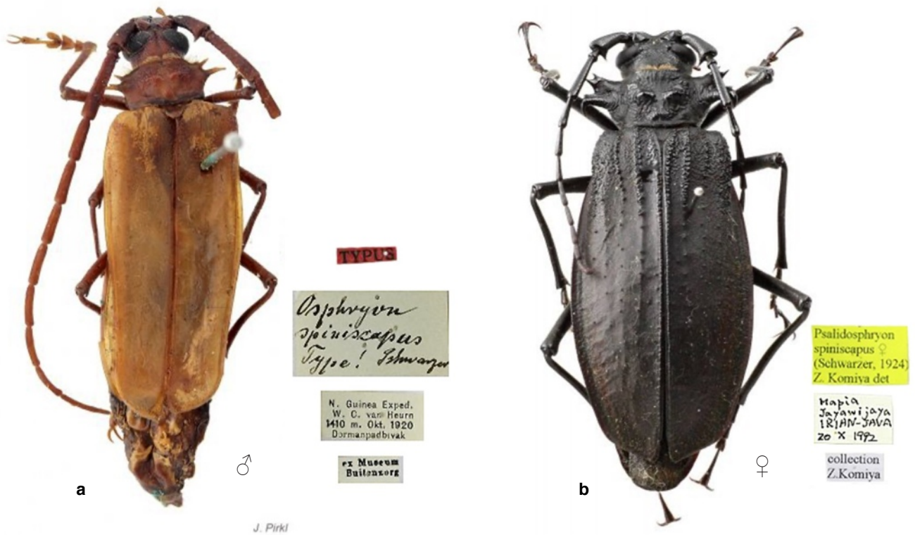
Fig. 1. Psalidosphryon spiniscapus (Schwarzer, 1924): a) ♂, holotype, SMFD; b) ♀, BMNH.

beinahe 2 mal: so lang als das 4., Dorsalforche des 3. Gliedes und die Riefung dieses und der folgenden Glieder genau wie bei der verglichenen Art. Halsschild an den Seiten mit nur 2 Dornen; der eine am Vorderrand schlank, spitz, gerade und schräg nach aussen (vorn) gerichtet, der andere dahinter, sehr kräftig, nach rückwärts gebogen, fast zweispitzig, als ob 2 Dornen verwachsen wären; alle Dornen sind etwas nach oben gerichtet. Basis fein gerandet, Vorderrand in der Mitte schwach eingebuchtet, von der Basis zur Mitte breiter werdend. Dorsalfläche uneben mit 3 grösseren Beulen: eine an der Basis in der Mitte, zwei etwas grössere quer hinter der Mitte, die Verflachung dieser Beulen nach dem Vorderrande zu grob punktiert, sonst ist die Scheibe glatt. Die Flügeldecken sind beim vorliegenden Stück noch nicht völlig ausgefärbt, sie erscheinen hinter der Mitte schwach verengt, wie eingebuchtet, die Spitzen sind verrundet, Naht ohne Dorn. Im Basalviertel -- oder Fünftel -- hat jede Decke zwischen Schildchen und Schulter zwei schwach nach innen gebogene Granelrippen; Schienen sind gebogen, die Hinterschienen stärker. Tarsen schlank und beträchtlich länger als bei adustus . ♀ unbekannt.