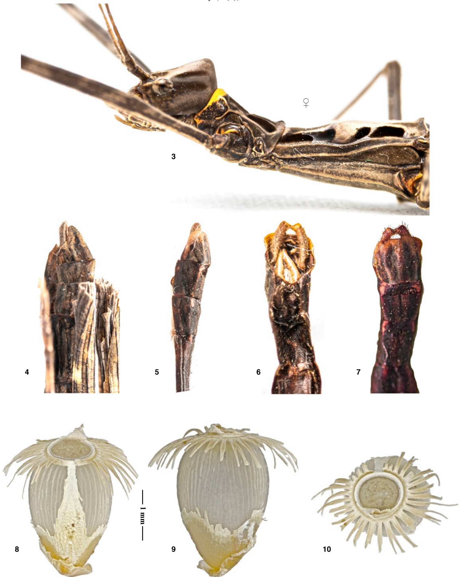
Fig. 3-10. T. maculicollis yunnanensis subsp. nov.

3-4) Holotype, ♀: 3) Head and thorax, lateral view; 4) Apex of abdomen, lateral view. 5-7) Paratype, ♂, apex of abdomen: 5) Lateral view; 6) Ventral view; 7) Dorsal view. 8-10) Egg: 8) Dorsal view; 9) Lateral view; 10) Anterior view.