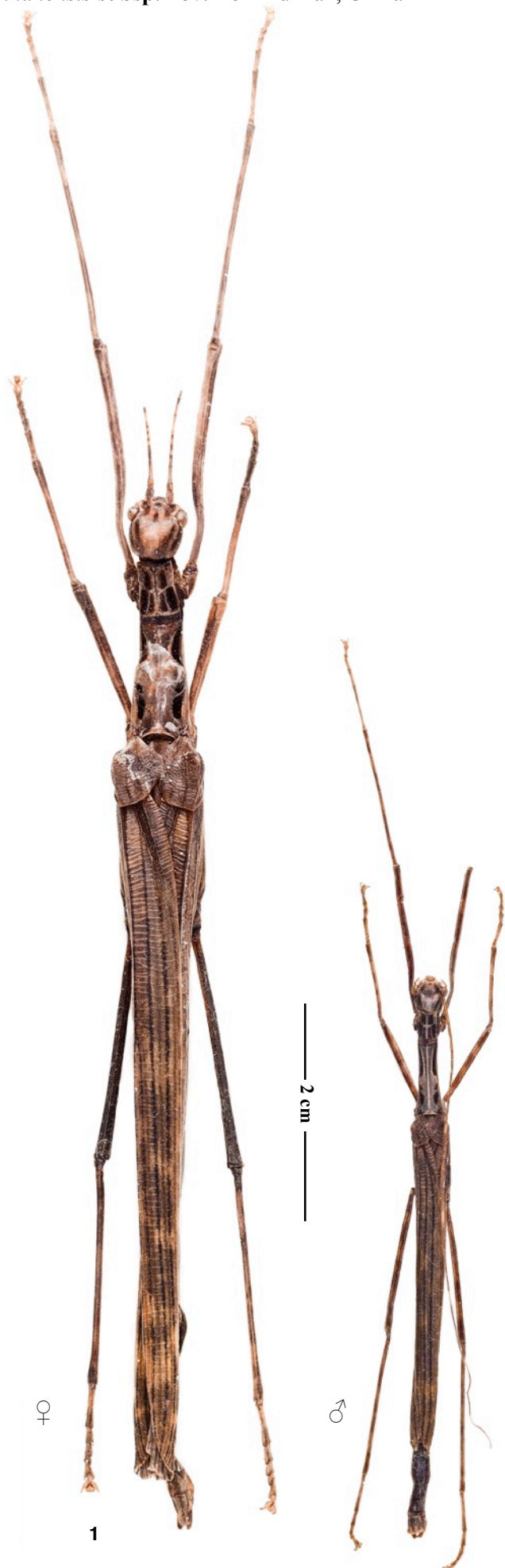
Fig. 1-2. T. maculicollis yunnanensis subsp. nov., habitus, dorsal view. 1) Holotype, ♀. 2) Paratype, ♂.

Thorax. – Dark brown with black maculae. Pronotum with a pair parallel rows of three black maculae, with conspicuous mid-longitudinal sulcus. Pronotum anterior margin curved inward and light yellow, hind margin is black. Mesonotum almost 2.5 times longer than pronotum. Mesonotum with a pair of three black maculae, front macula long and stripe-shape, middle one tiny and hind one triangular. Mesopleuron smooth and setose. Metasternum fused to abdominal sternum I.