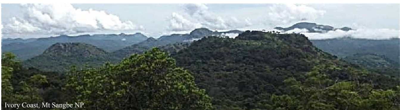
Ivory Coast, Mt Sangbe NP.

Mots-clés. – Coleoptera, Dermestidae, Attageninae, Attagenus , taxinomie, nouvelle espèce, description, Côte d'Ivoire.