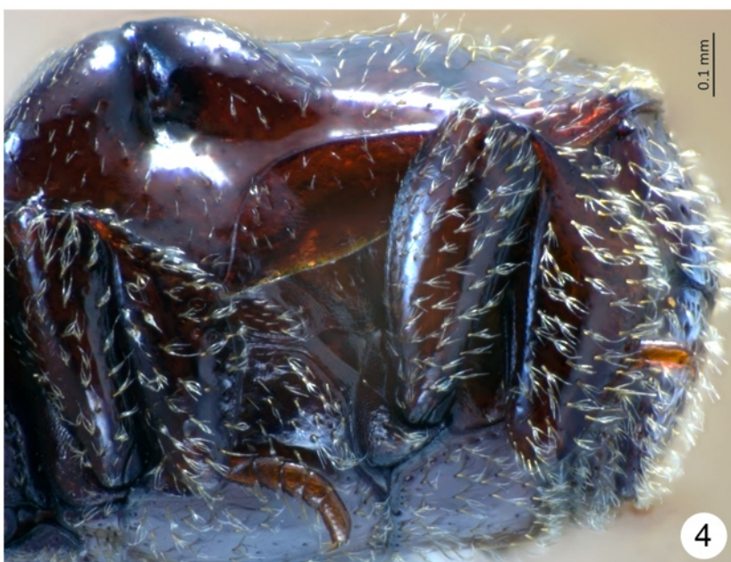
Fig. 1-4. – Habitus and body details of Eucurtiopsis ashei Caterino & Tishechkin, 2007 and of E. davaoensis Théry & Sokolov n. sp. – 1 : habitus of E. ashei , dorsal view. – 2 : hind part of E. ashei , lateral view. – 3 : habitus of E. davaoensis Théry & Sokolov n. sp., dorsal view. – 4 : hind part of E. davaoensis Théry & Sokolov n. sp., lateral view.