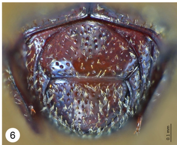
Fig. 5-6. – Body details of E. davaoensis Théry & Sokolov n. sp. – 5 : head and antennae (male). – 6 : propygidium and pygidium.